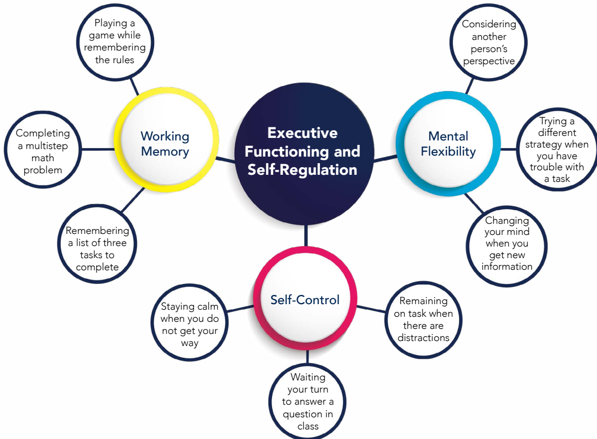
Figure 2. Examples of Executive Functioning and Self-Regulation